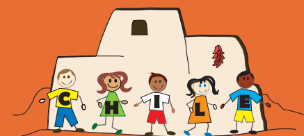
Child Health Initiative for Lifelong Eating & Exercise